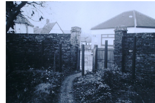
Bugdon House - see the remains of a WW2 blockade on George Lane, designed to prevent enemy troops crossing the river.