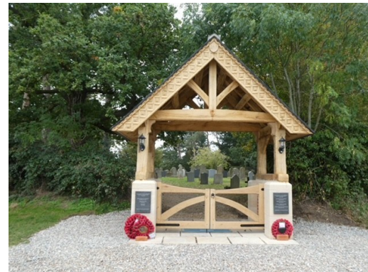
Chedgrave Lychgate - formally dedicated on 30 September 2018 to remember those that fell in WW1 and WW2.