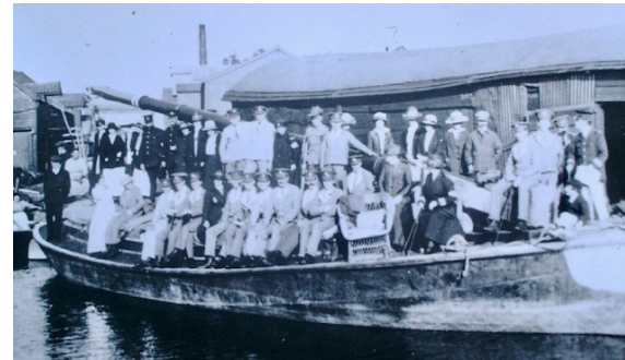
Loddon Staithe - During WW1, recuperating soldiers enjoyed occasional wherry trips to Chedgrave Common.