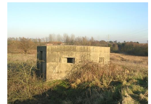
Pillboxes - Three WW2 pillboxes once stood in Loddon. These structures allowed soldiers to defend the area from invasion. The photograph shows the one that is adjacent to High Bungay Road/ A146 if you face East into the field.