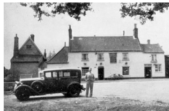
Chedgrave White Horse - During WW2, the Women's Voluntary Service ran a canteen here, where soldiers played games and relaxed. Photo dated 1936.