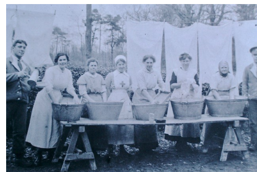
WW1 Red Cross Hospital Nurses - This is a photograph of the nurses on wash day.