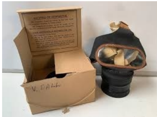
The Old School, Church Plain - During WW2, the school here doubled in size to welcome evacuees from East London. All children had to carry a gas mask for use if there was an attack.