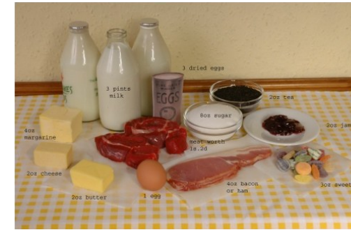
Local Food Office - Food was rationed in WW2. Check out the display in Youngs window, showing ration books and groceries from the time.