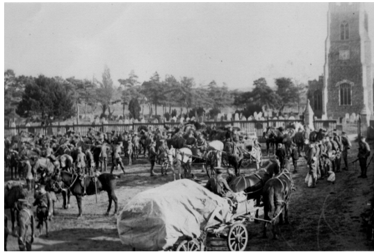
Church Plain - This photograph from WW1 shows the Cheshire Yeomanry, who were billeted at Langley Hall.