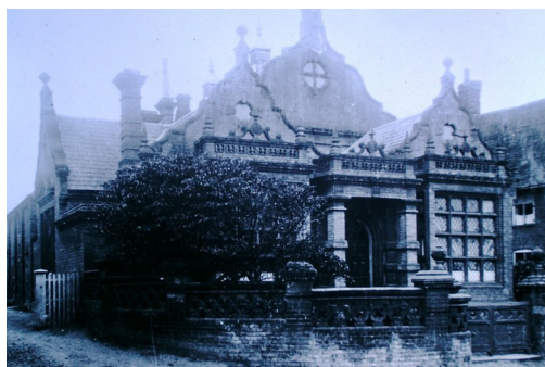
Loddon Town Hall - A 'Welcome Home' dinner was held here in 1919 for WW1 soldiers. In WW2, this building became the Civil Defence HQ. Even boxing matches were held here!