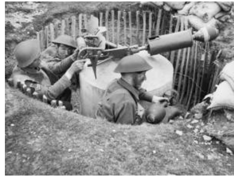
Old Market Green/Playing Field - Find the base for the Spigot Mortar Thimble. A powerful anti-tank weapon could be placed on here for WW2 defence.