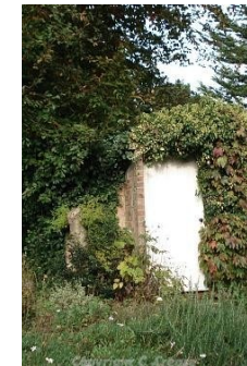
3 Beccles Road (Rodwell House) - The garden still houses a WW2 Air Raid shelter built to accommodate around 20 people.