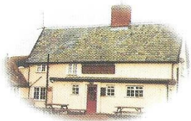
Earsham Queen Real ales, fine food