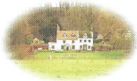
Cold Bath House