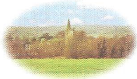
Earsham Church View from Constitution Hill