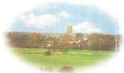
Bungay View from Constitution Hill