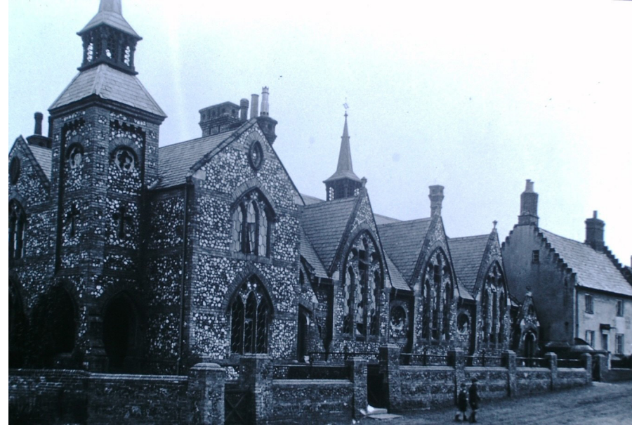
This copy of an old postcard from around 1900 shows the completed building with a more modern picture of the headmaster's house, on the left. The very ornate bell housing and elaborate chimneys have long gone but the main building still remains today.