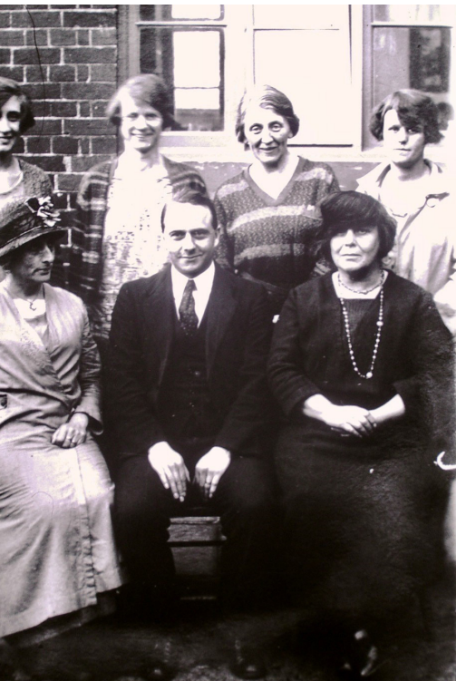
The school teachers.

It can also be seen, in enlarged form, on the current library wall.