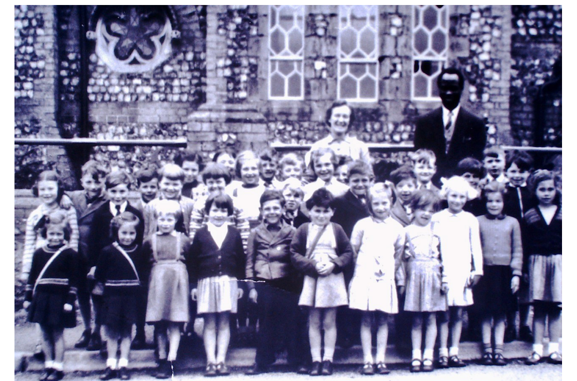
One of the classes in the 1950's

Currently it is used by The Town Council, as their office and the large room at the rear is occupied by Loddon Community Gym.