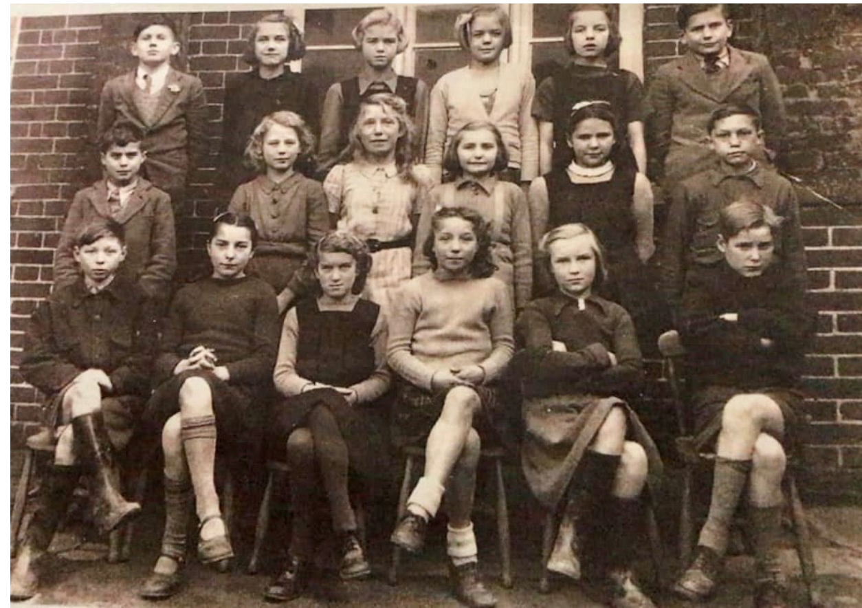
These children are a mixed class from around 1948.

The extension allowed for access from Market Place and the construction of a toilet block.