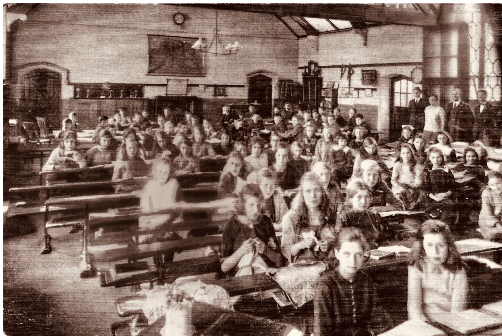
This picture shows a class of children in the schoolroom that is now Loddon Library. Note the partition doors that could be pulled across to separate the area into two classes.

It can also be seen, in enlarged form, on the current library wall.