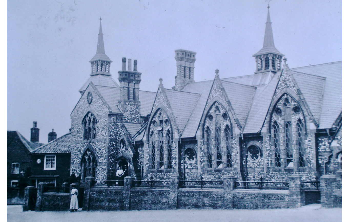
This photo shows a clearer view of the headmaster's house from a different angle. The building to the left, which was a cafe, is now the Co-op supermarket. This was extended in recent years.

For more information please refer to the website at loddonhistorygroup.co.uk where you can view other photographs and contact details.