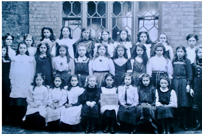
The writing on the slate in the centre reads: Loddon Girls Class 1 1911.